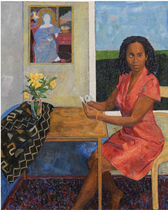
Border | 84" x 80"