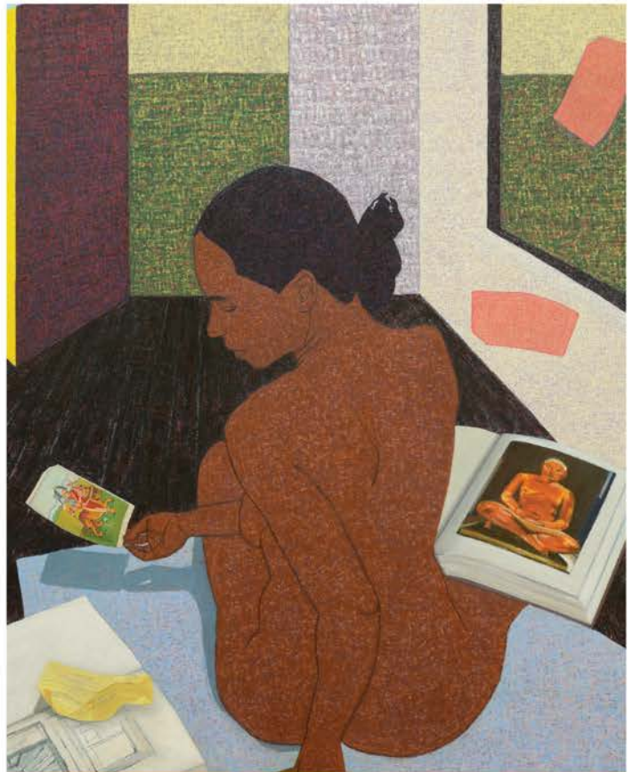
A Real Allegory of Her Studio | 84" x 96"