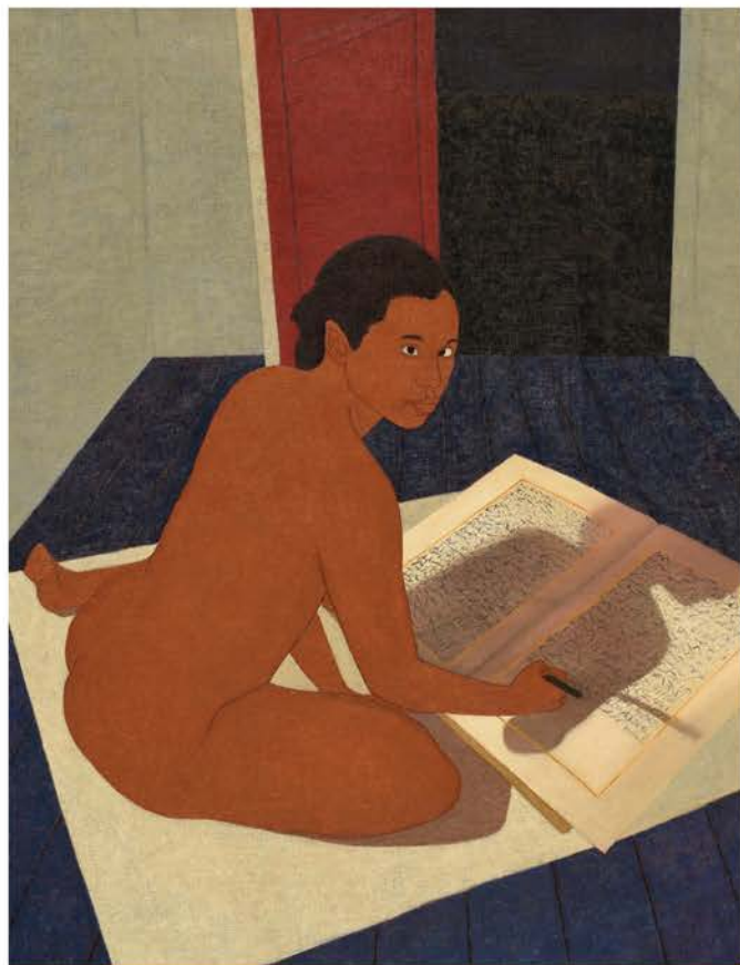
Seated Scribbler | 84" x 80"