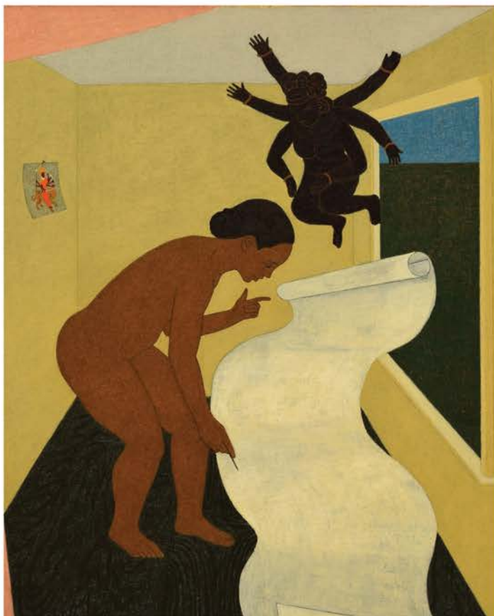
Author | 84" x 80"