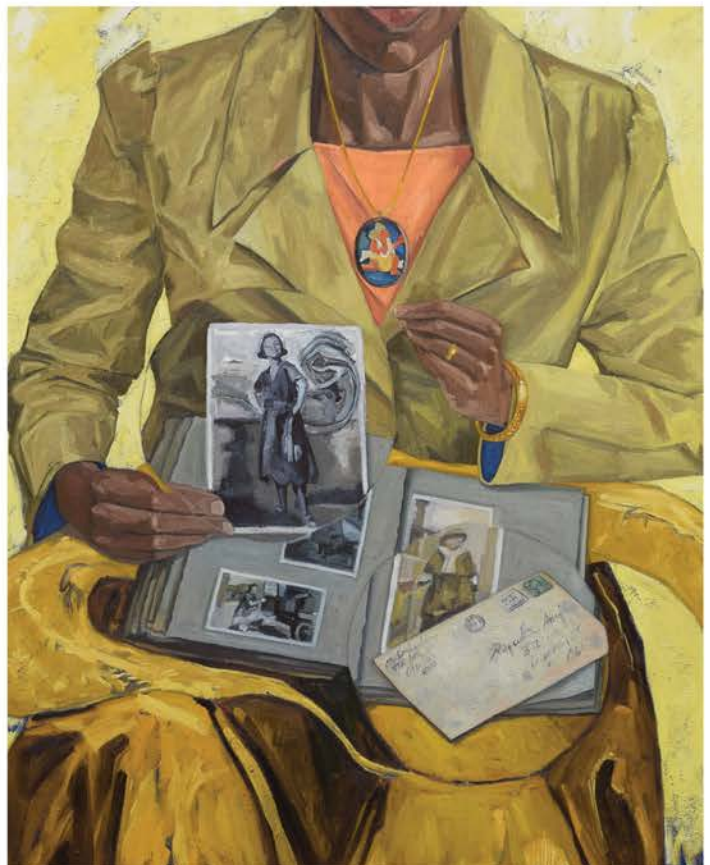
Birthright | 84" x 80"