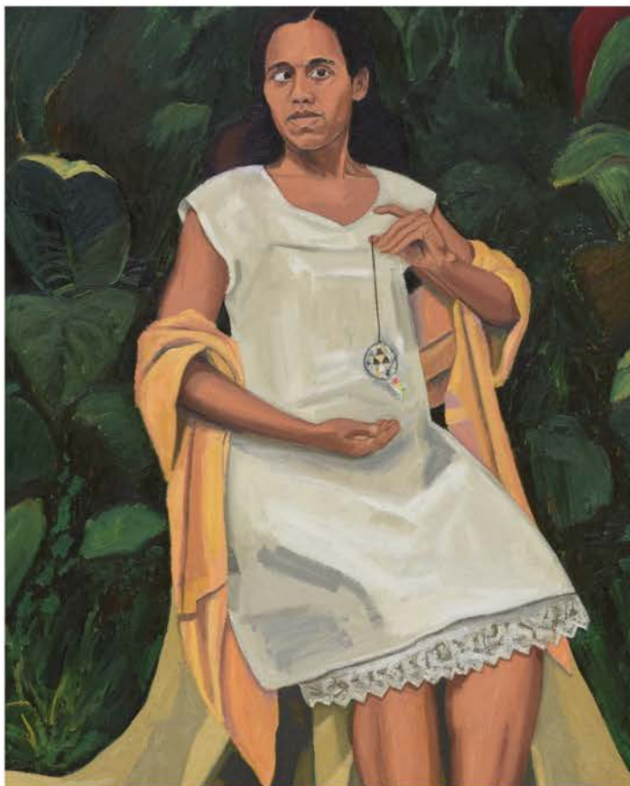
Charm | 42" x 40"