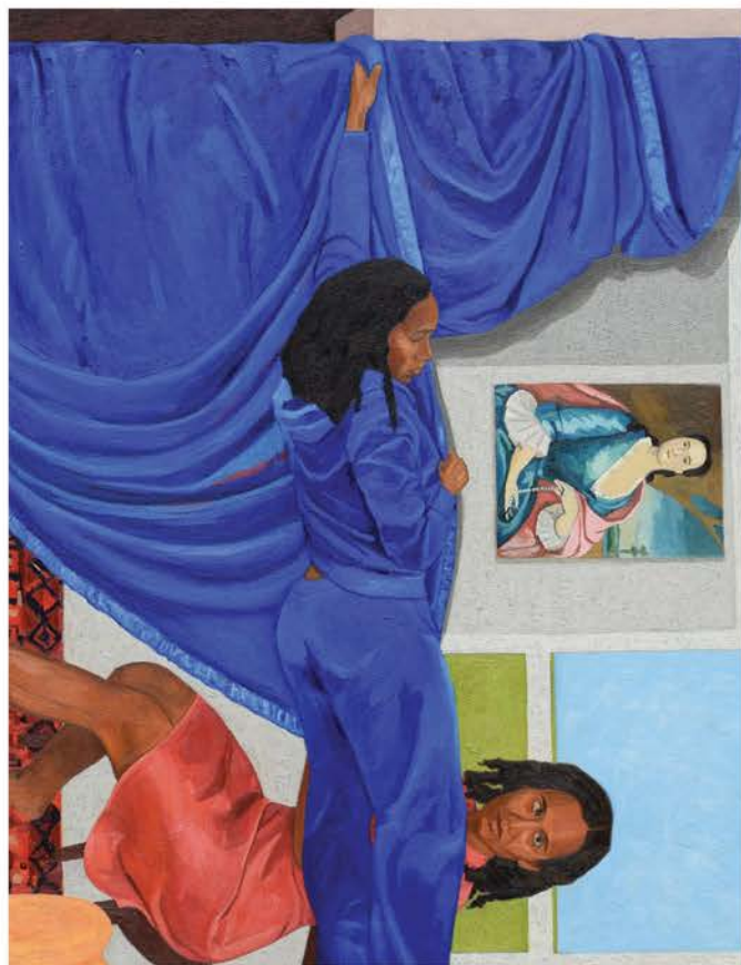
Close Quote | 84" x 80"