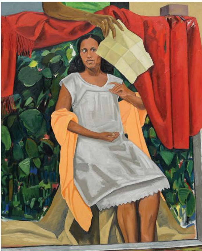
Sales Slip | 84" x 80"