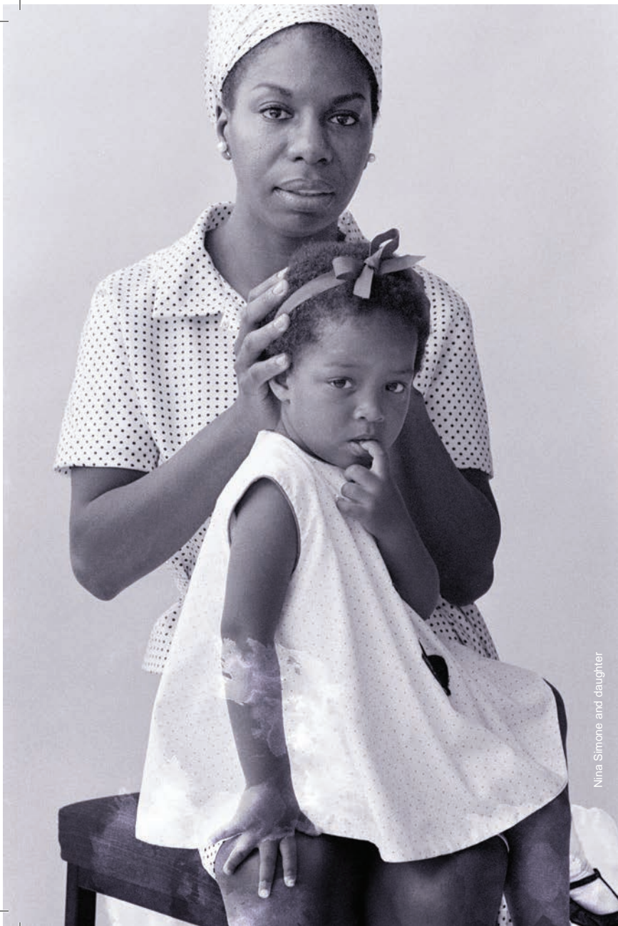
Nina Simone and daughter