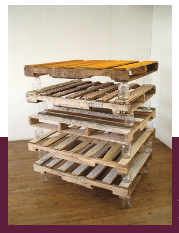
Invisible Cargo Spices/foodstuffs and mason jars on wooden shipping pallets Dimensions Variable, 2007

MY EXPLORATION into "the medium" began simply with a personal interest in human geography; focusing on the questions why, where and how my grandparents found their way to Jamaica. I discovered that plausible answers to those questions were heavily shaped by centuries of trade in the Caribbean's history. Economies in the Caribbean and Latin America were dependent on cheap labor from Africa, China and India and raw goods such as sugarcane, cocoa, and bananas. I began to explore the relationships between these imported laborers and the exports produced by their labor, and the stories and ideas that these relationships carried. I also started to think about how materials can have the same narrative qualities as figurative paintings: they can imply a historical context, they can provide a vocabulary for double entendre, and they often have built in associations that can act as emotional stimuli. With these ideas in hand, I have set off to investigate the ways in which I can combine materials, not only to tell a story, but also to act as a catalyst for discussions surrounding trade as a medium.