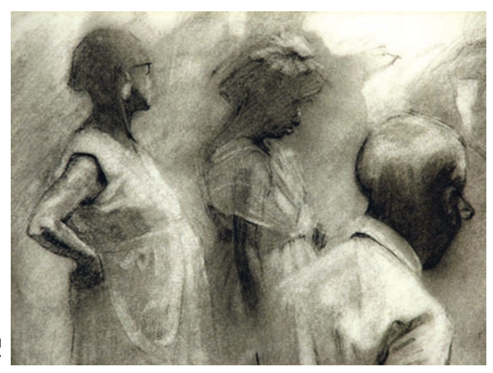
The Outing (detail) Charcoal on paper, 50" x 25"