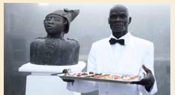
From top: High Yella Masterpiece: We Ain't No Cotton Pickin' Negroes by Amy Sherald, Frederick Douglass and the White Negro (2008), Moloch Tropical (2009)

Thursday Mar. 15 | 7pm The Stone Center Hitchcock Multipurpose Room