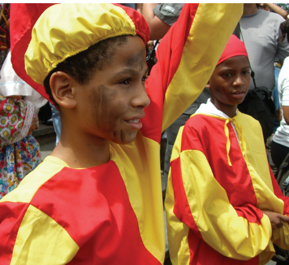
Curiepe Festival in Venezuela.

The application deadline for fall 2010 is February 18, 2010. UNC at Chapel Hill students interested in the program should visit the Study Abroad Web site at http://studyabroad.unc.edu for more information and application instructions. ■