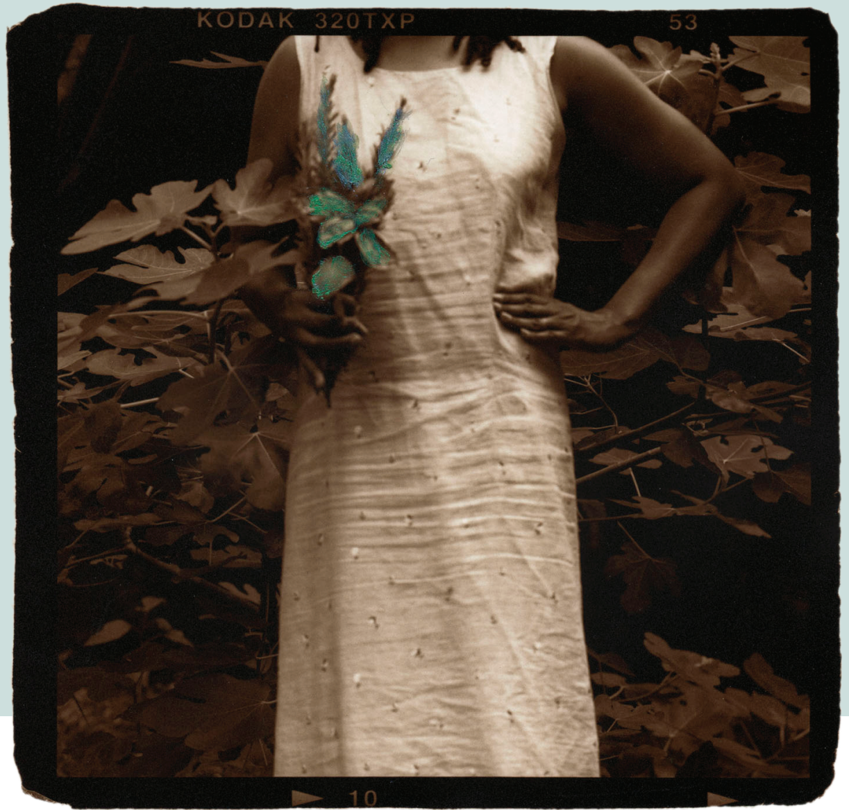
above: Lucía Mendez, Servidoras de Misterios con Flores para los Seres III , Acrylic on Canvas, 72"x14"