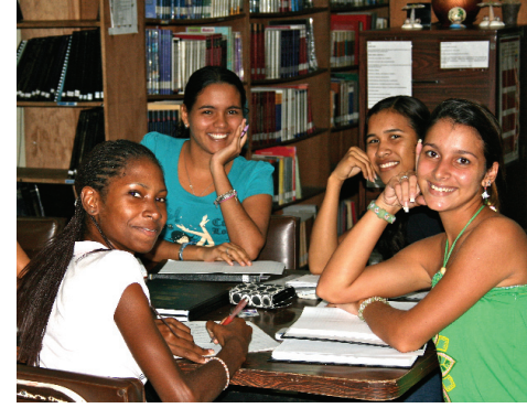
Instituto Universitario de Barlovento students studying in the library

Persons interested in meeting the visiting students should contact the Stone Center at (919) 962-9001. ■