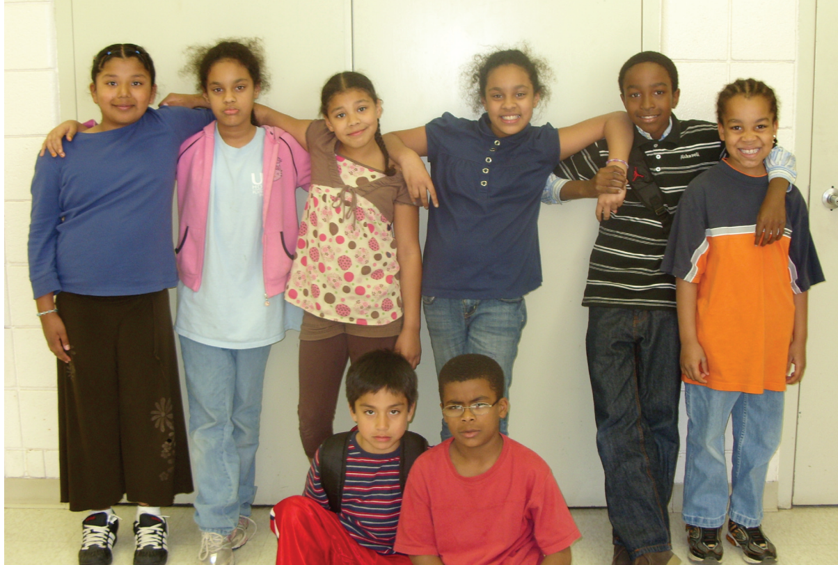
Community program participants gather for a group photo