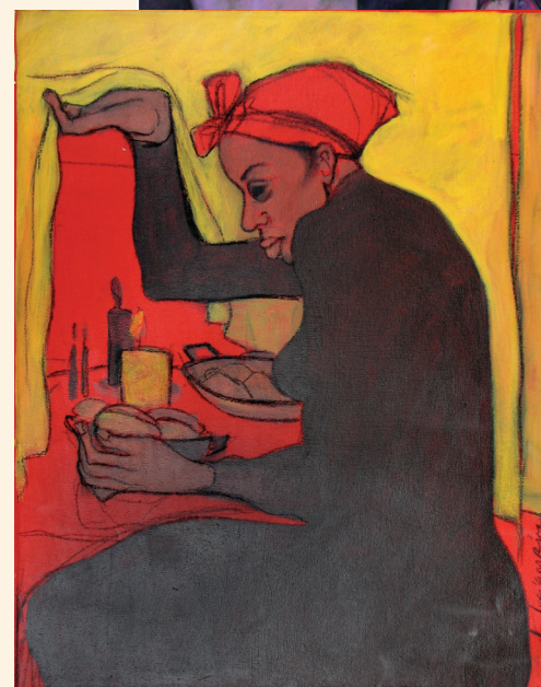
above, top: Lucia Mendez, Con los Seres en la Cabeza , Mix Media on Canvas 12" x 9"