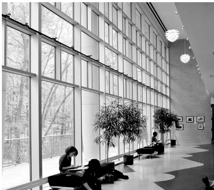
Stone Center Lobby.

To make an immediate gift to the Center, complete and mail in the donor support form on the back or visit the Stone Center website at www.unc.edu/depts/stonecenter click on 'make a gift to the center'. ■