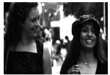
Film stills from This Moment (above, top) and Dreams & Passions (above)