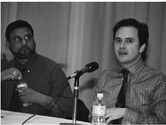
Identity Politics Reconsidered