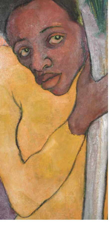
(LEFT TO RIGHT) VELA PARA LOS SERES, LA REINA EN AZUL, FLORES PARA EL SERVICIO DE LOS SANTOS