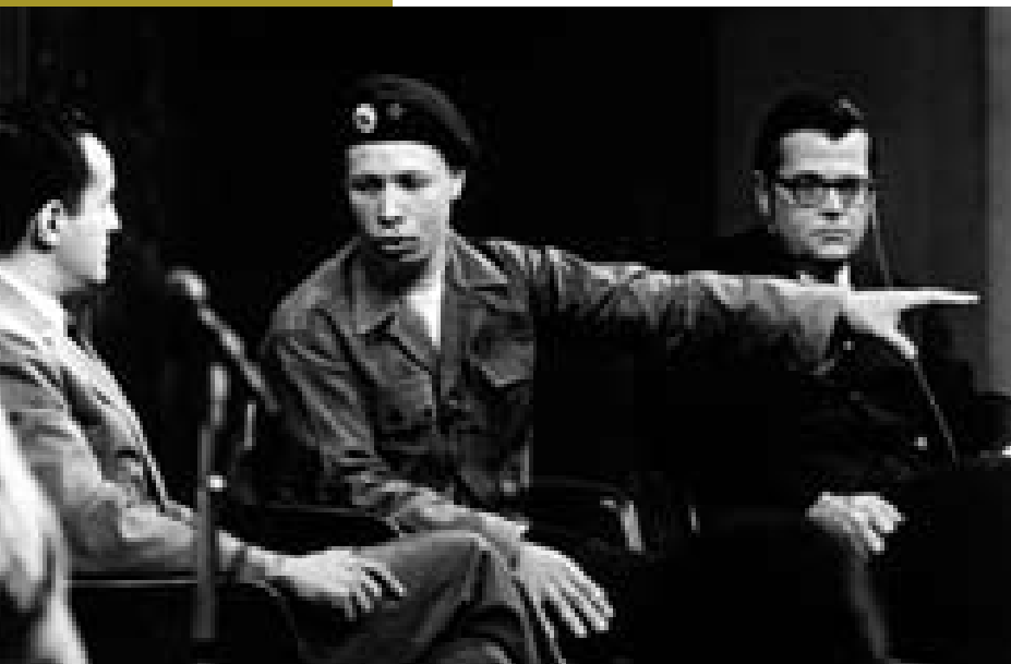
Cha Cha Appearing on Local Program, Chicago 8 × 10 Black and White Photograph

Political limitations of the period notwithstanding, the Young Lords represents the best of sixties radicalism. Organizing with the benefit of years of movement experience, the bold confrontational style of Young Lords' campaigns were effective in achieving immediate local reforms. At their best, their community organizing campaigns attempted to extend the meaning of American democracy, especially as they put forth a new vision of society based on humane priorities. ☞