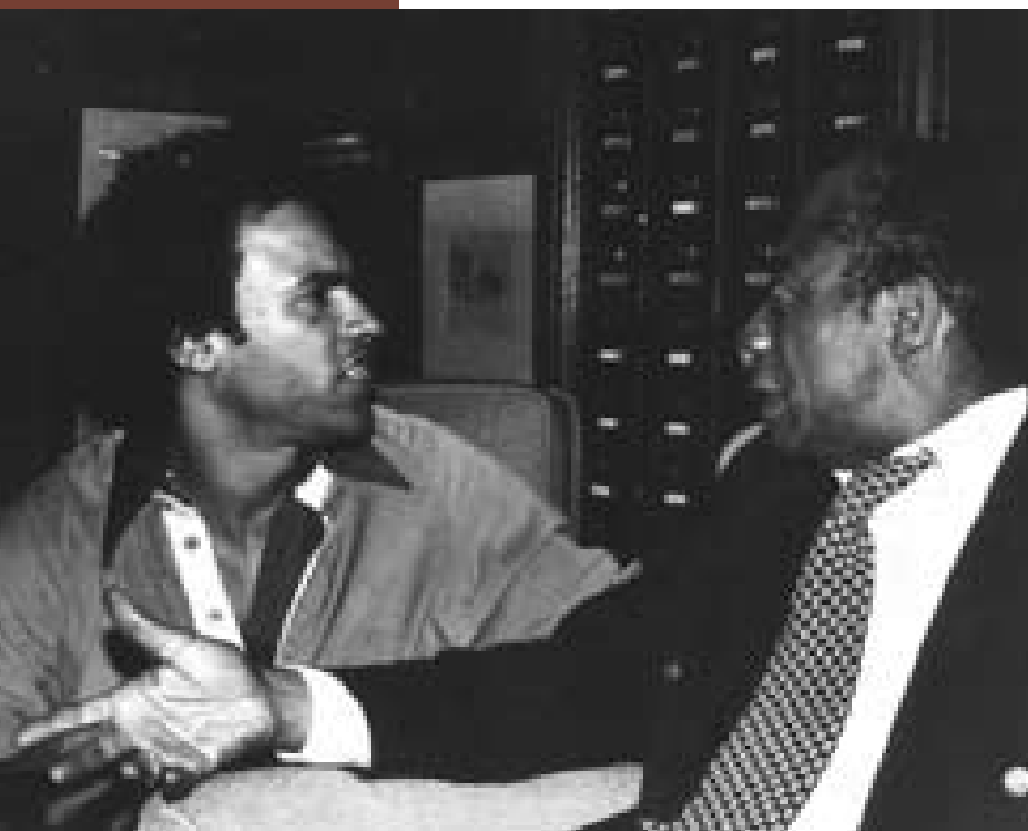
Huey Newton With James Baldwin (1969) 8 × 10 Black and White Photograph

During its sixteen-year life span, 1966 to 1982, the BPP went through five distinct stages. In the first, from October 1966 to December 1967, the party was a revolutionary California-based organization engaged in grassroots activism in the Oakland Bay area and Los Angeles. The second phase, January 1968 to April 1971, represents the heyday of the Black Panther Party, during which the overwhelming majority of BPP chapters across the United States were formed. This rapid expansion led to intense political re-