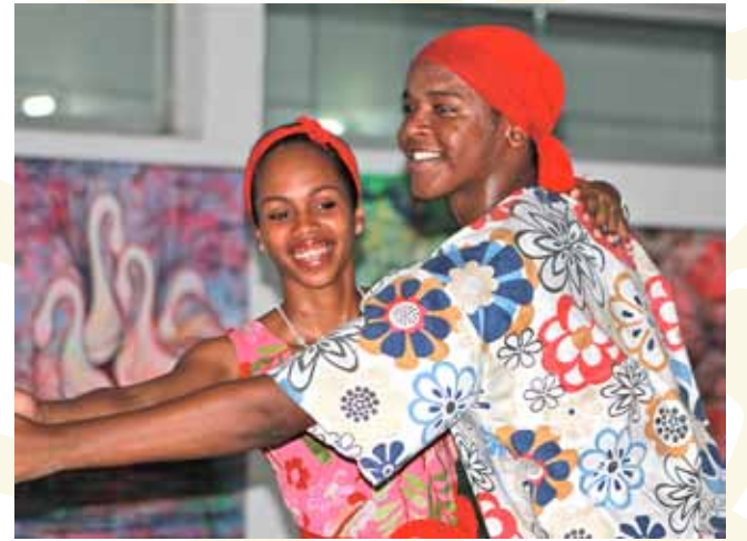
Clockwise, from top-left: Students survey threatened Mangroves in the coastal region near Higuerote; Program participants pitch in to shell cacao beans after roasting; Venezuelan performers from the Danzas Tacarigua dance and musical group