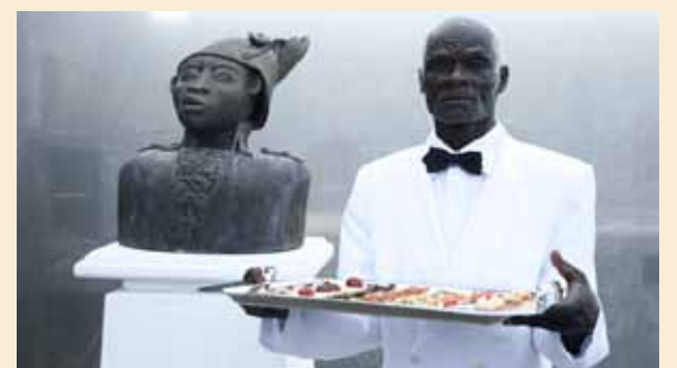
From top: High Yella Masterpiece: We Ain't No Cotton Pickin' Negroes by Amy Sherald, Frederick Douglass and the White Negro (2008), Moloch Tropical (2009)

Thursday Mar. 15 | 7pm The Stone Center Hitchcock Multipurpose Room