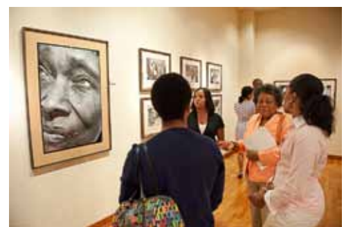
Top: Melissa Harris-Perry