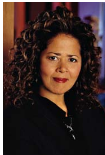
Anna Devere Smith